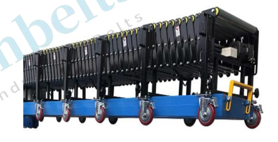
Coated Roller For Bags, Using Rubber