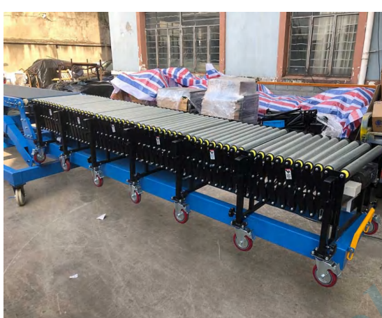
7.2m flexible powered roller conveyor