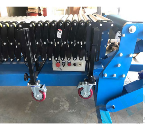
Flexible conveyor with independent control box