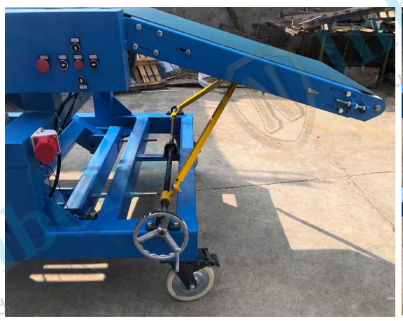
End slave section height is adjustable by hand wheel