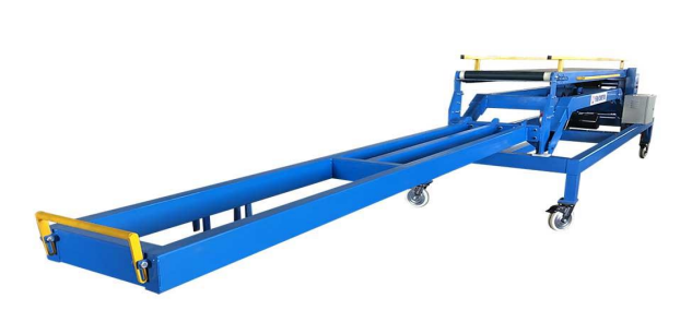
Flexible conveyor Supporting Bracket