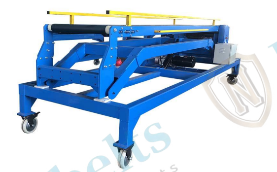
Truck Loading Conveyor Main Frame