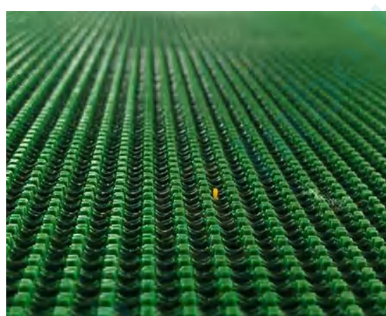
5mm thick rough top PVC belt