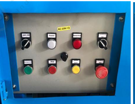
Control panel for machine