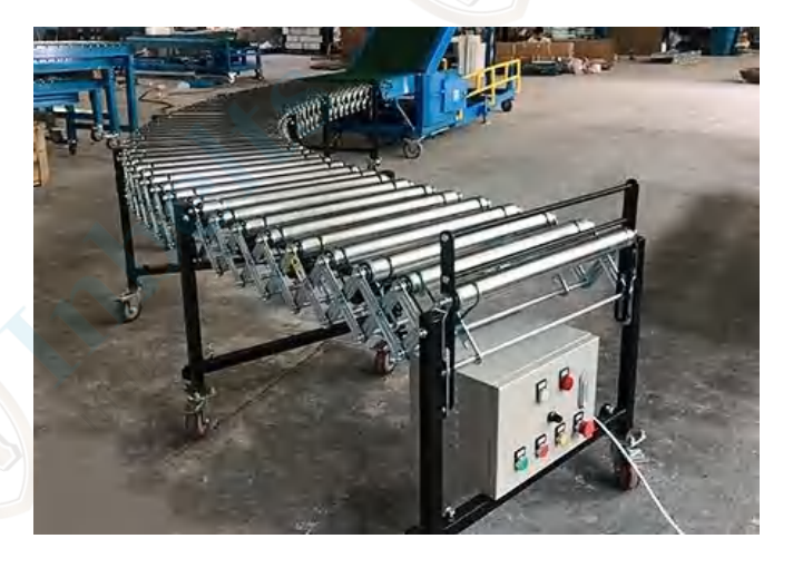
Combine with flexible powered roller conveyor to reach close to the target