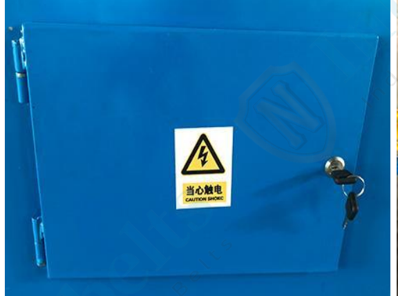
Control panel with cover door to protect the buttons