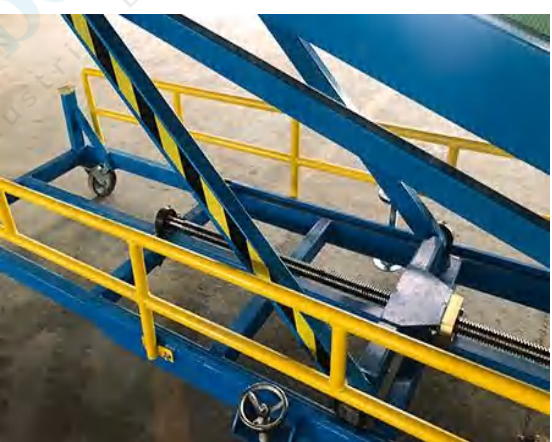
Safety guard to prevent people down into the machine